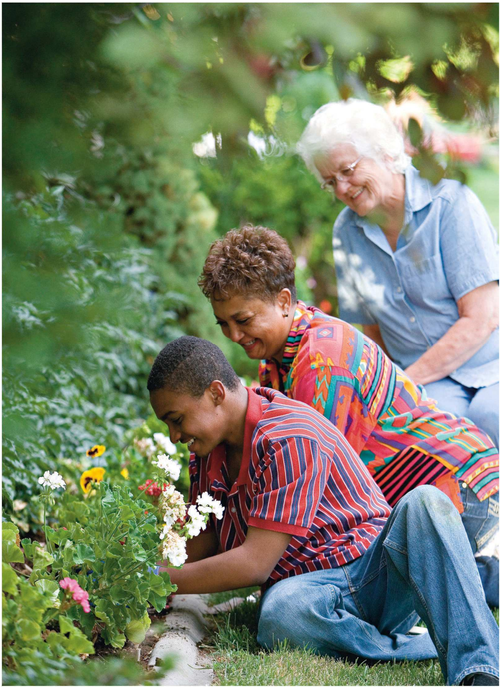
Service, photo © 2006 Robert Casey