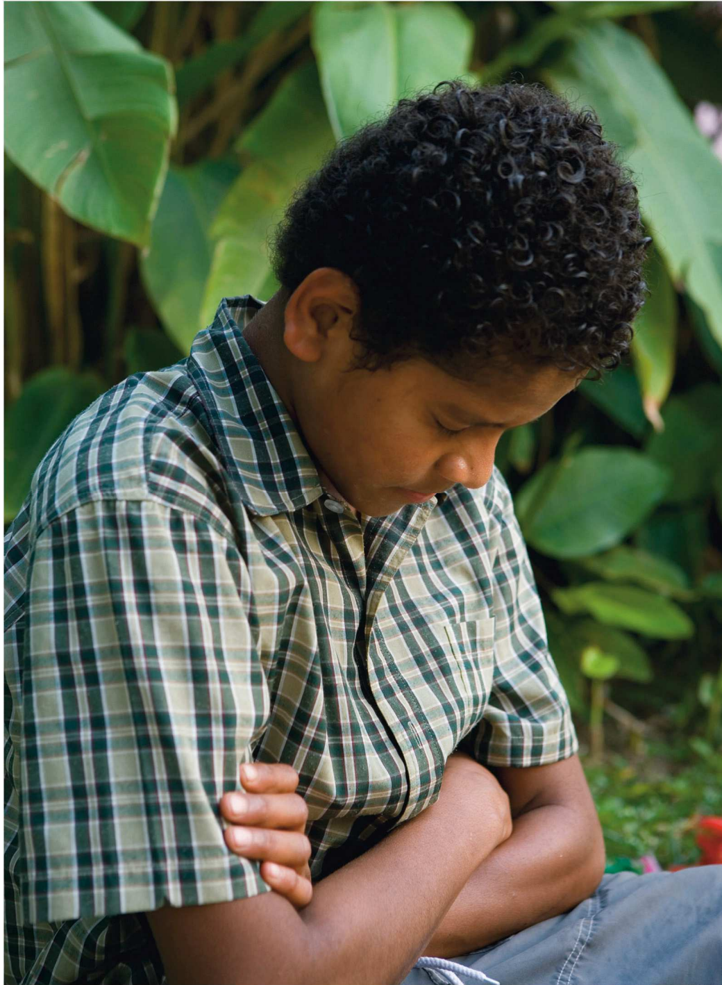
Young Boy Praying