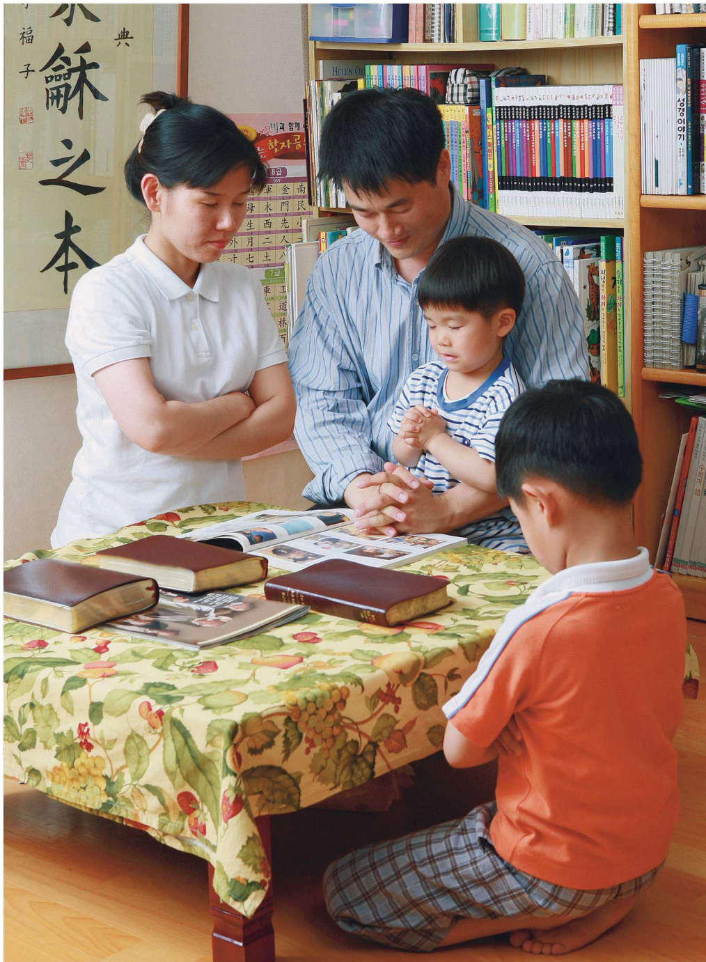
Family Prayer, photo © 2006 Hyun-Gyu Lee