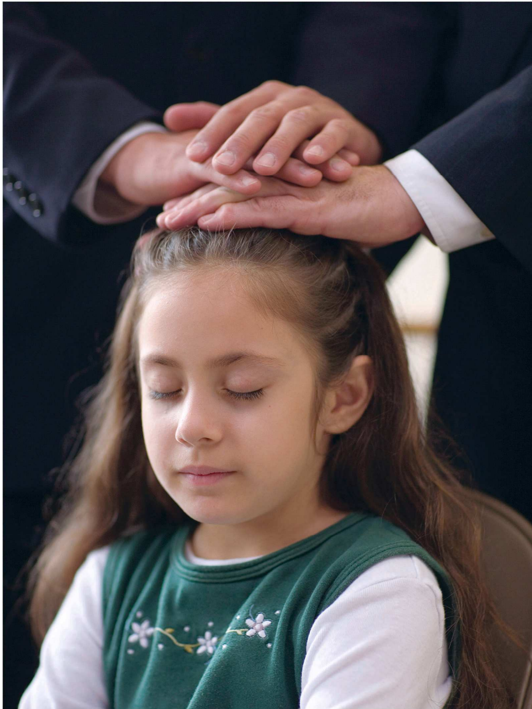
The Gift of the Holy Ghost